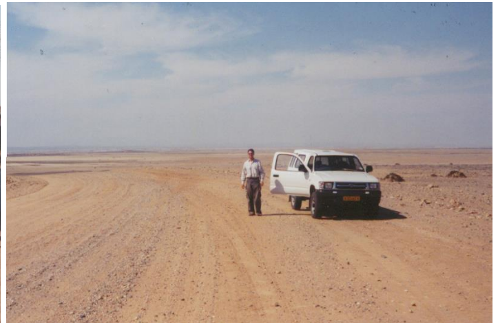
A230 Several miles up the coast – very desolate!