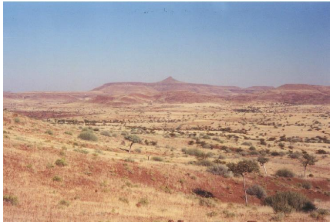
A340 Left-most of three panoramic pictures

Fuel for fires is quite scarce. Guide told of non-natives burning the stalks and dying from breathing in the smoke.