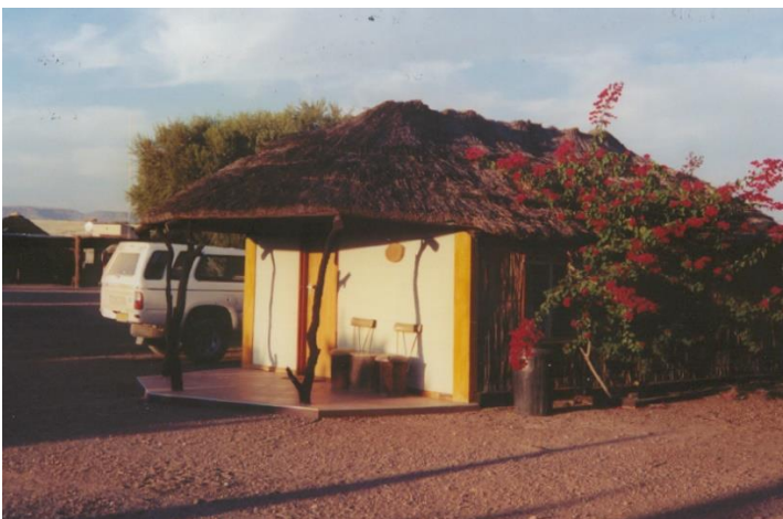
A275 Delicious evening meal, good overnight lodging.

We turned inland at Torra Bay and drove to Palmweg – about half way between Skelton Coast and Estosha Pan