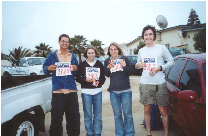
A215 Marathon runners trained at Swakopmund