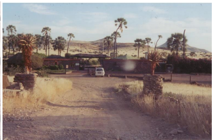
A270 Desert oasis at Palmweg – see map A100

We turned inland at Torra Bay and drove to Palmweg – about half way between Skelton Coast and Estosha Pan