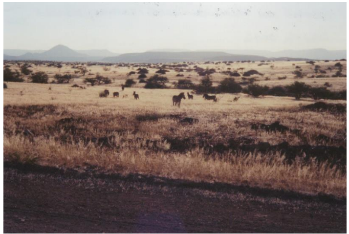
A300 Pictures of abundant wildlife from safari bus