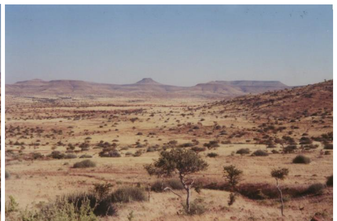
A320 Right-most of panoramic view.