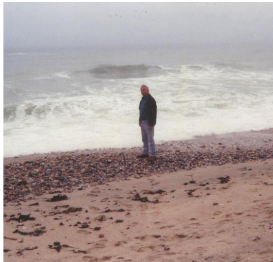
A200 EFB looking west to Atlantic Ocean