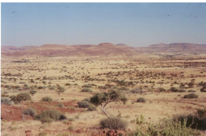
A330 Middle panoramic picture

Fuel for fires is quite scarce. Guide told of non-natives burning the stalks and dying from breathing in the smoke.