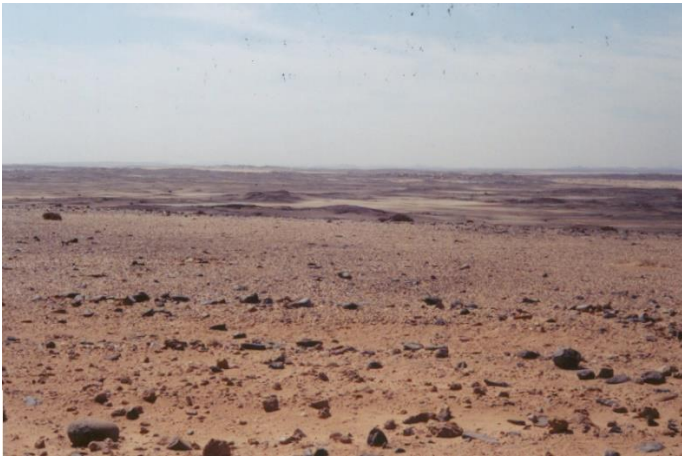
A240 From same spot, looking eastward