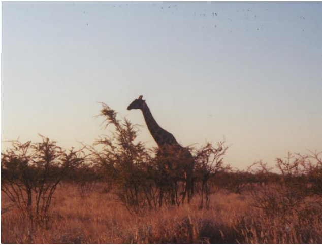
A290 Oh to have such foresight ability!