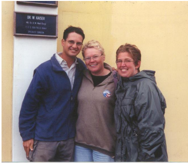
A190 Met other Peace Corps volunteers in Swakopmund