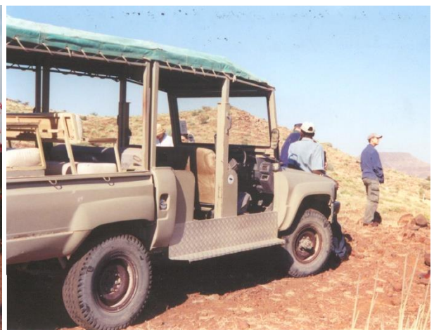
A280 Safari for 8 people, left at 7 a.m. – much to see!