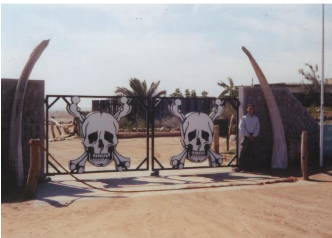
A220 Entrance to Skeleton Coast, sign-in required