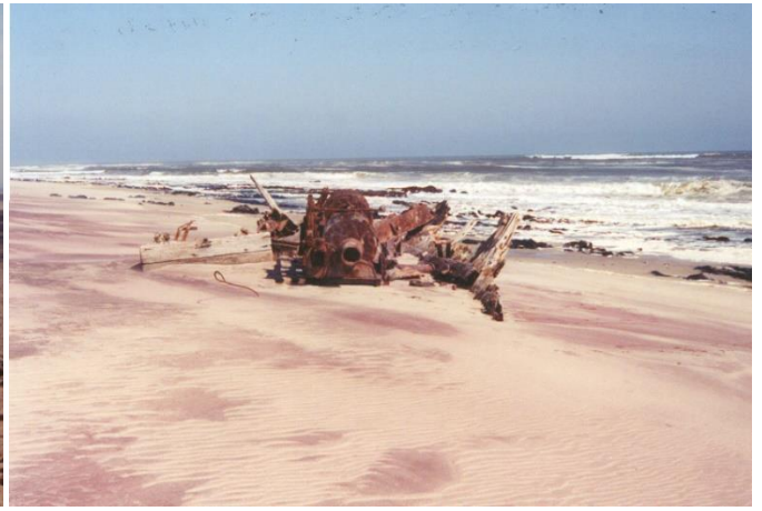
A250 Further up coast, remains of shipwreck!