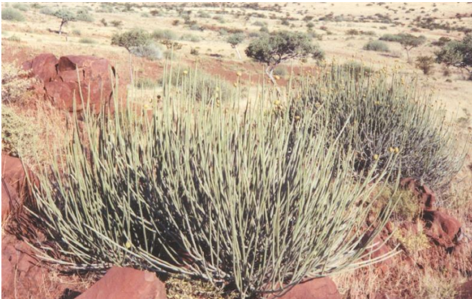
A310 Poisonous! Non-natives burn and smoke kills!