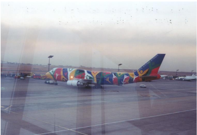
A650 In Johannesburg, decorated with 3000 lbs. paint.