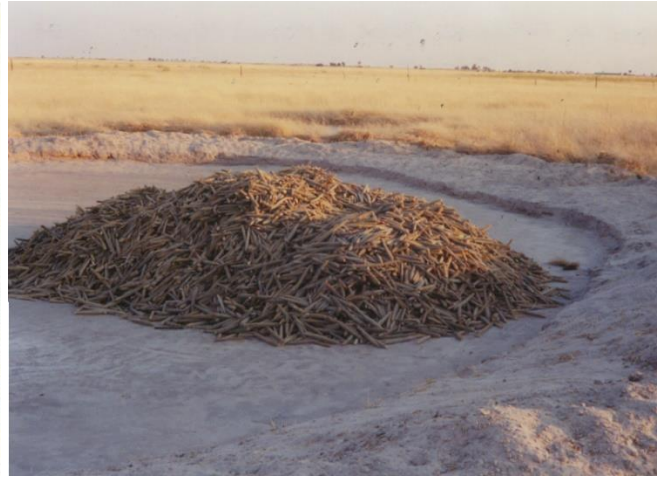
A530 Maize harvest on-going when I was there.