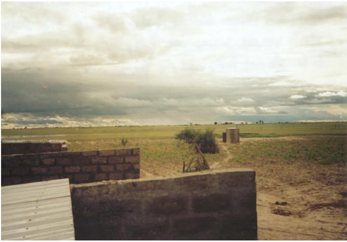
A520 Outhouse – photo taken when maize was young