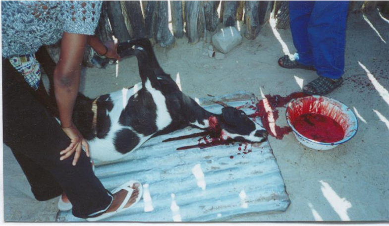
A550 Frank sent picture of butcher day