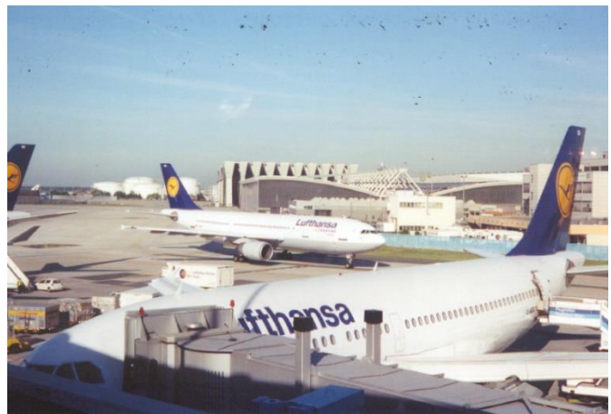
A660 In Frankfurt, Germany on way home.