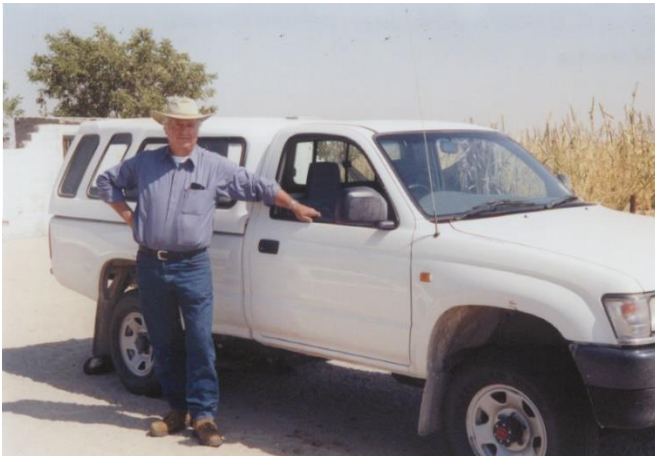
A570 Leaving solo to Windhoek, 450 km away