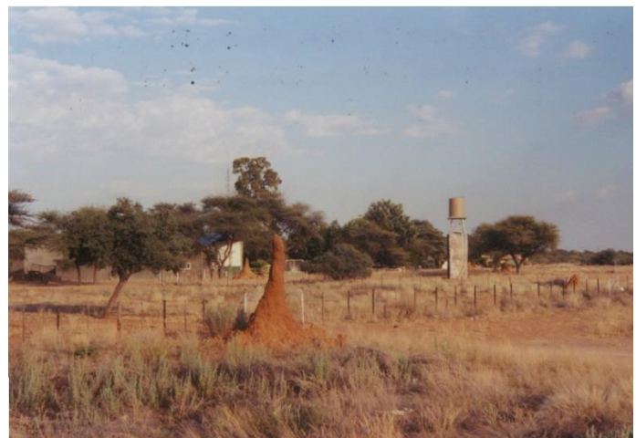
A640 Typical "Dutch" farm with water tank etc.