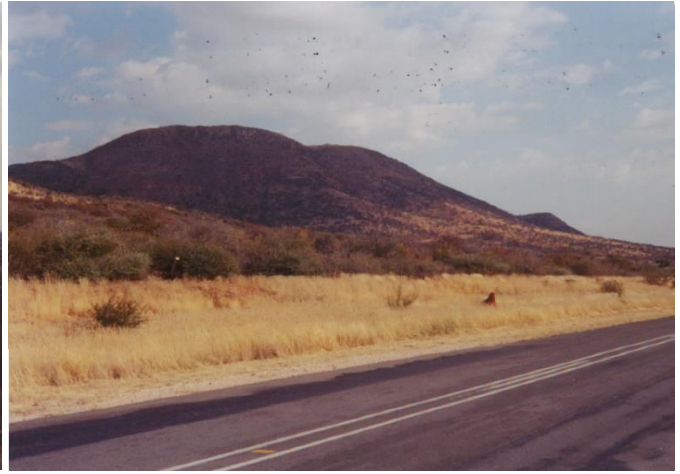
A620 Looking westward to rolling hills