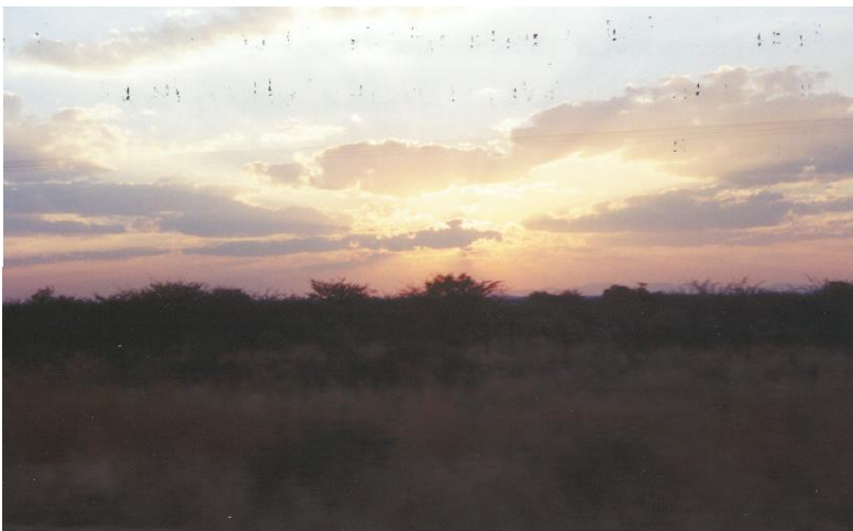
A590 Sunsets are pretty much the same world over?