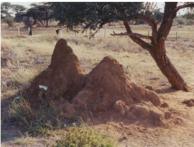
A630 Termite hill – many seen all over the place