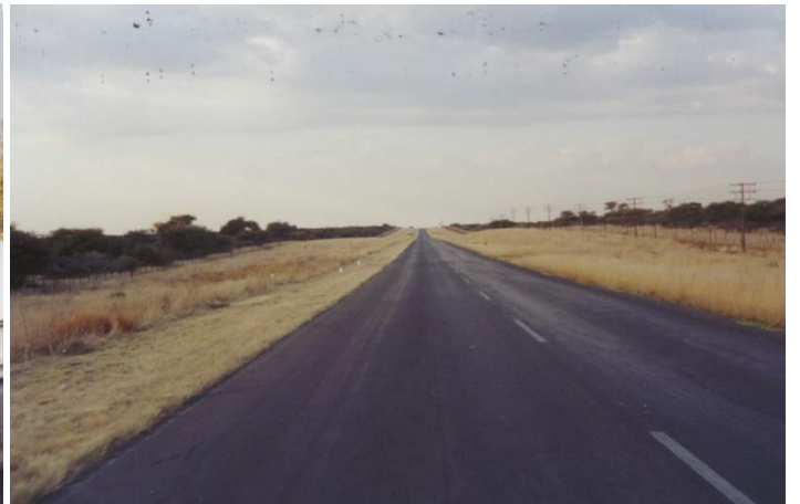
A580 Good road, drive on left, cruise at 120 km/hr.