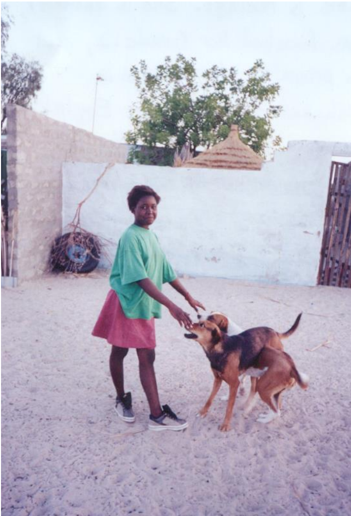
AXXX Nelago Teenager