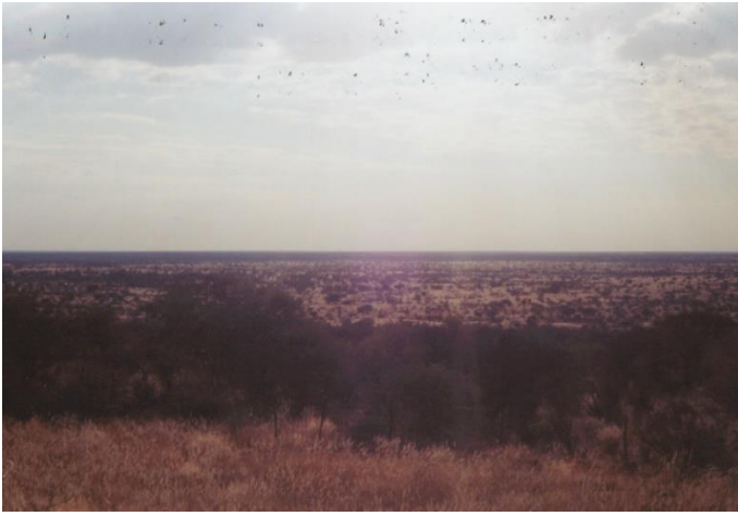
A610 Looking eastward to Kalahari Desert